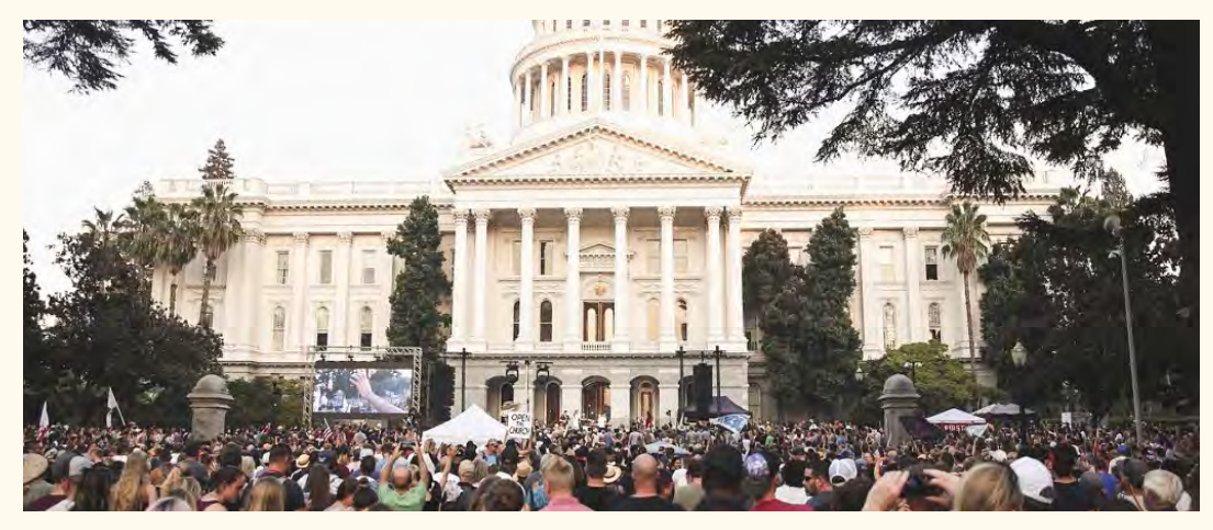
The Sacramento, California region of Northern California is filled with believers seen here--"Megachurches" abound-but who's enjoying Ekklesia--each one has?

"How is it then, brethren? Whenever you come together, each of you has a psalm, has a teaching, has a tongue, has a revelation, has an interpretation. Let all things be done for edification." 1 Corinthians 14:26